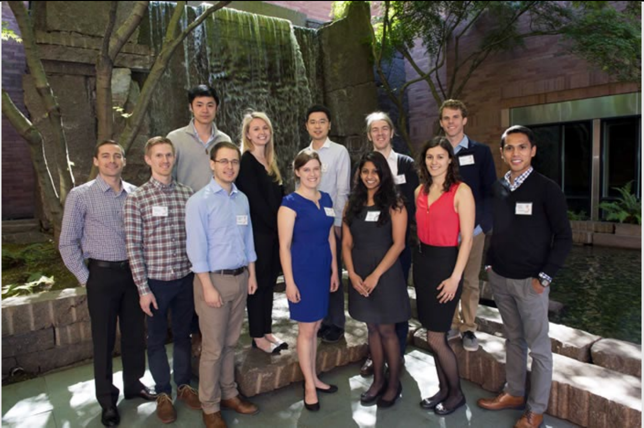
Year 2016 Recipients