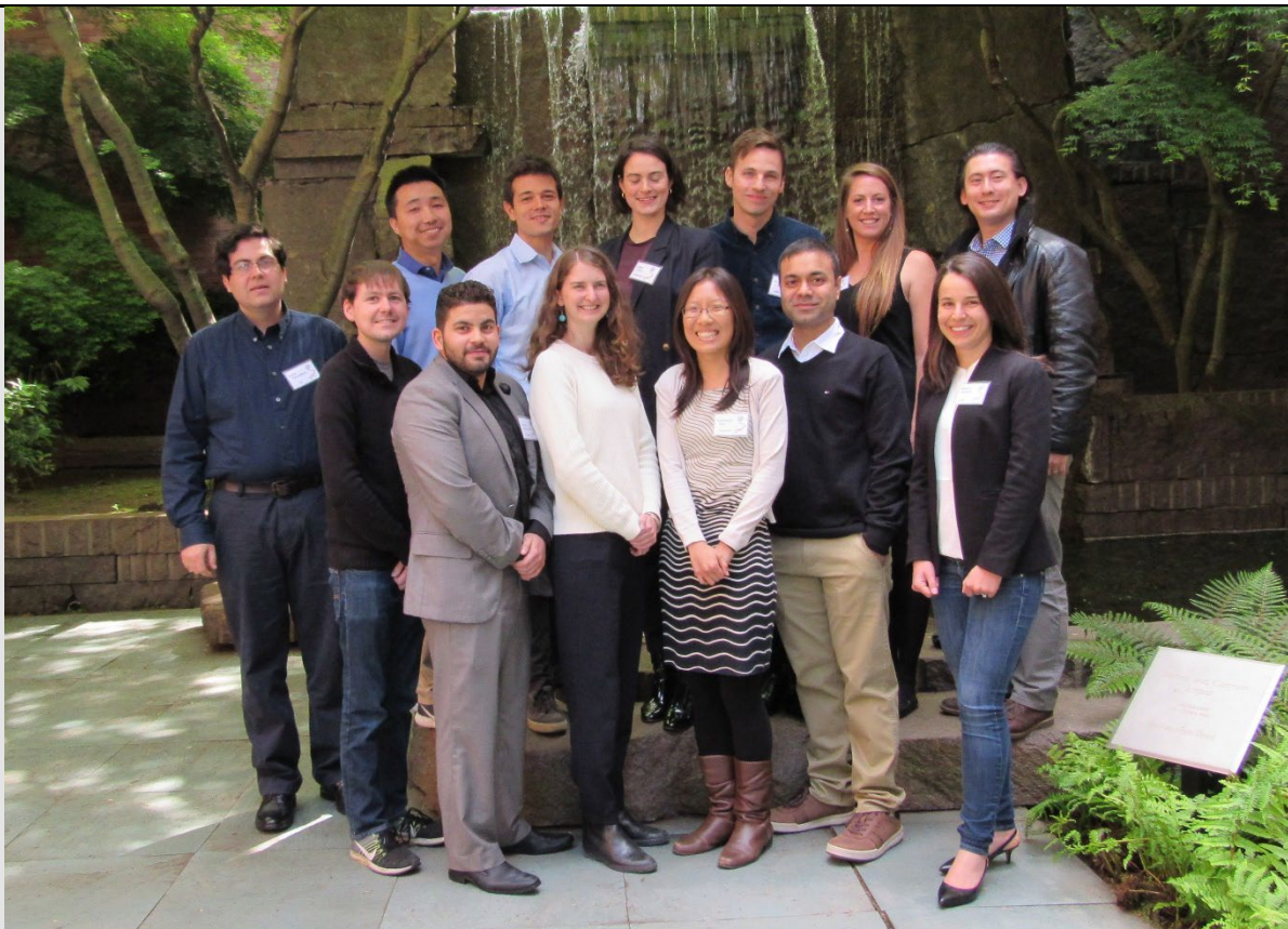
Year 2018 Recipients