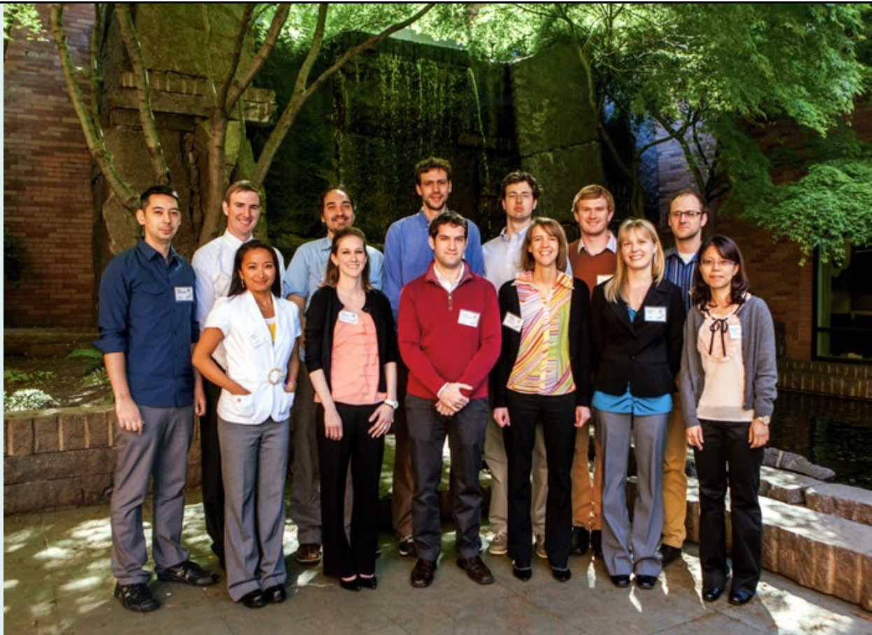
Year 2013 Recipients