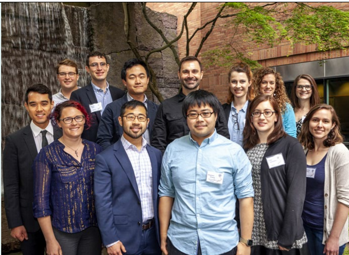
Year 2019 Recipients

2019 | 2018 | 2017 | 2016 | 2015 | 2014 | 2013 | 2012 | 2011 | 2010 | 2009 | 2008 | 2007 | 2006 | 2005 | 2004 | 2003 | 2002 | 2001 | 2000 |