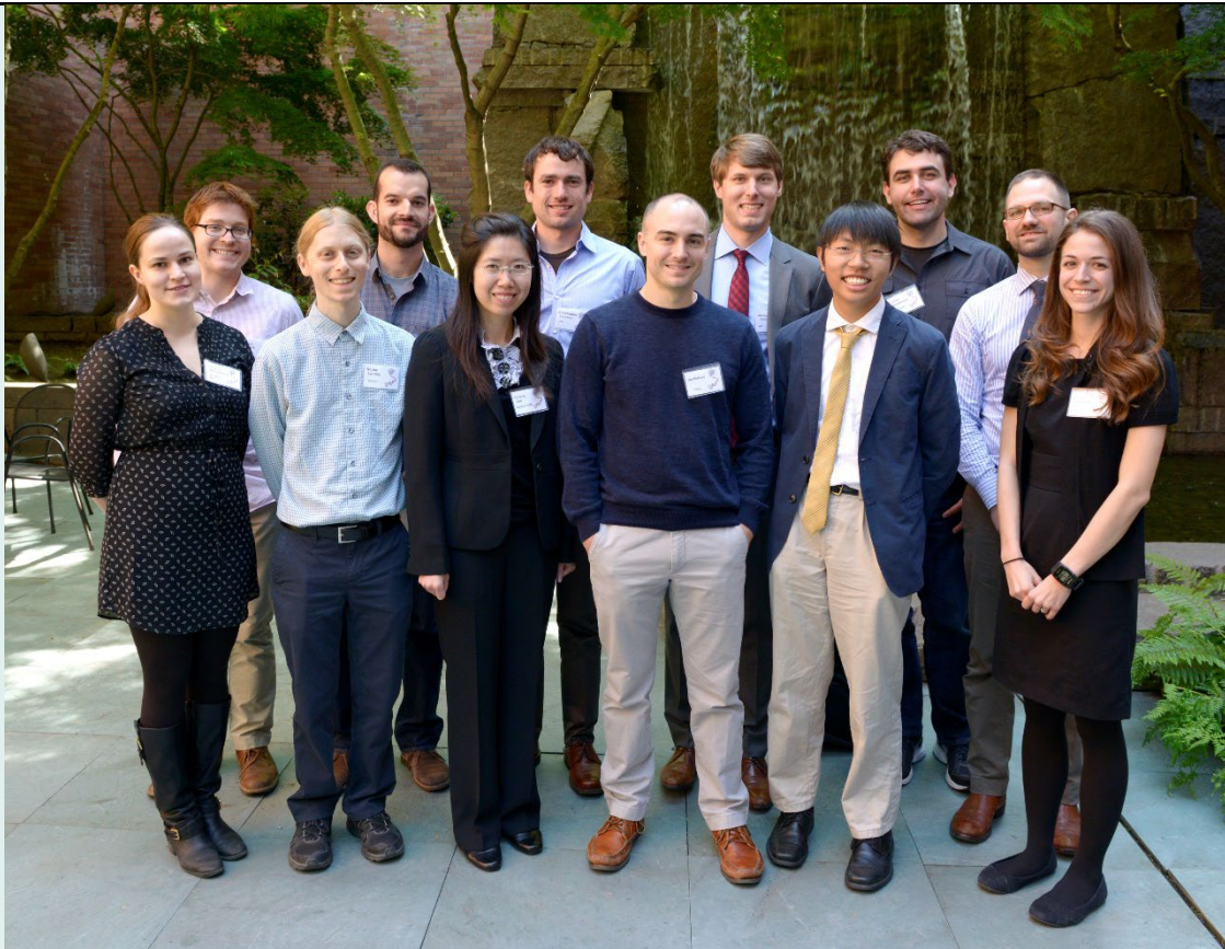
Year 2015 Recipients