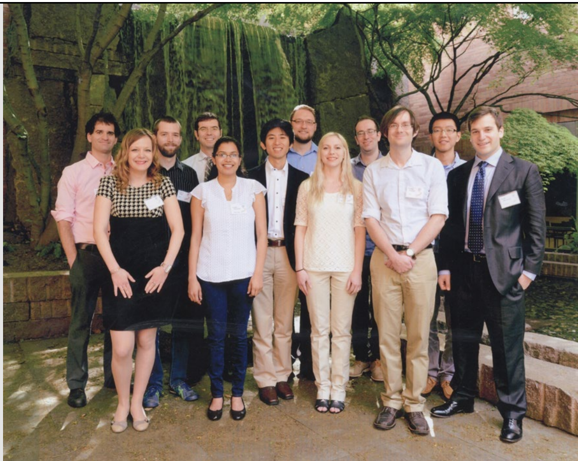
Year 2014 Recipients