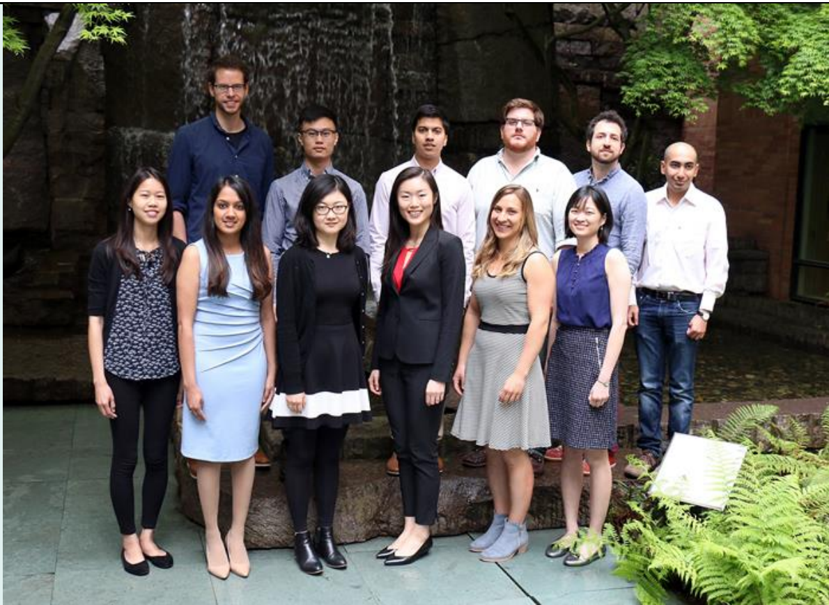
Year 2017 Recipients