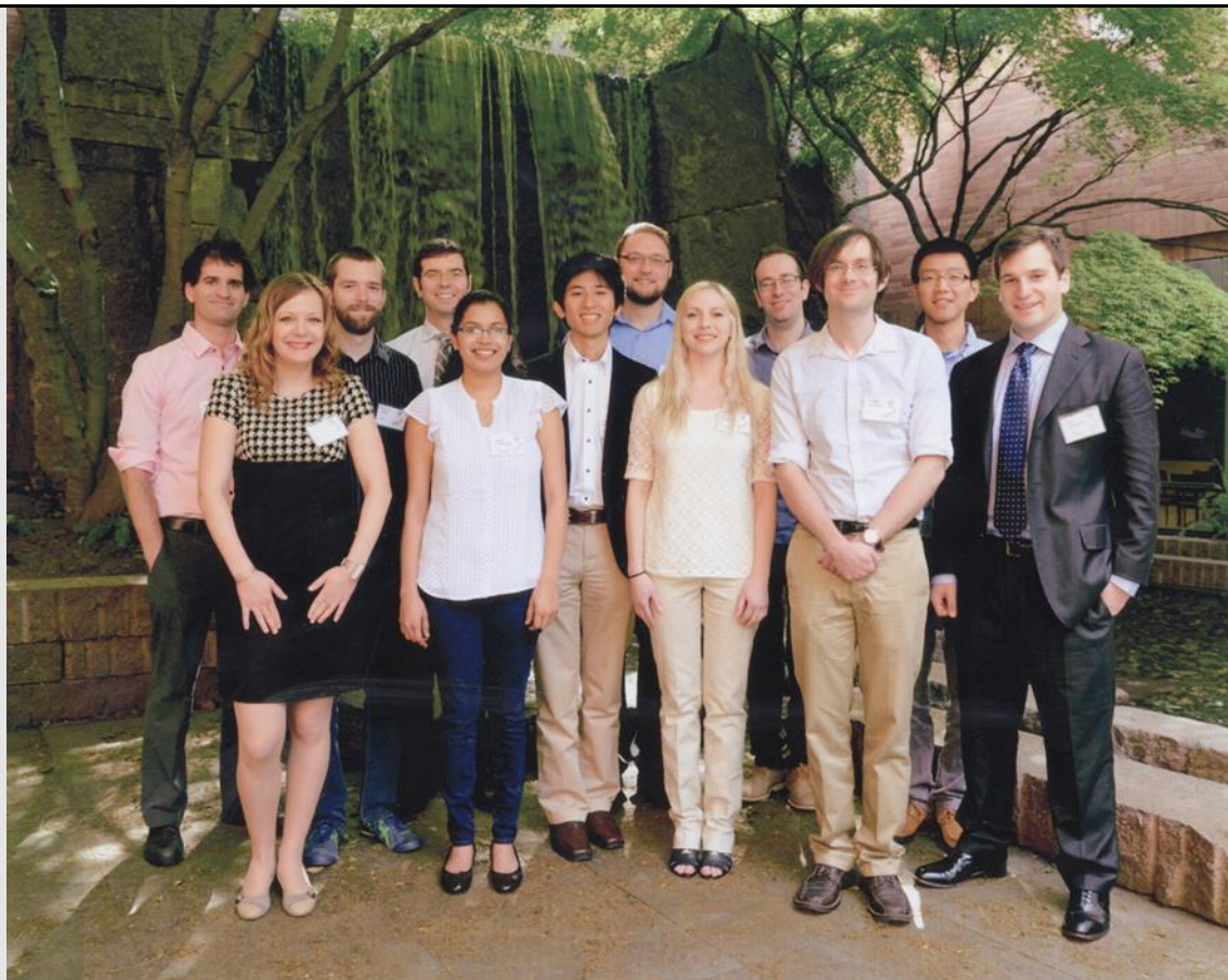
Year 2014 Recipients