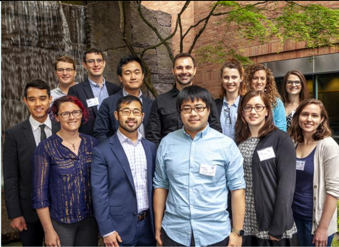
Year 2019 Recipients