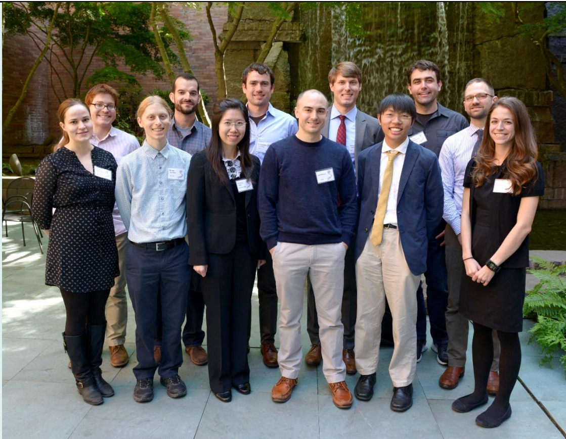
Year 2015 Recipients