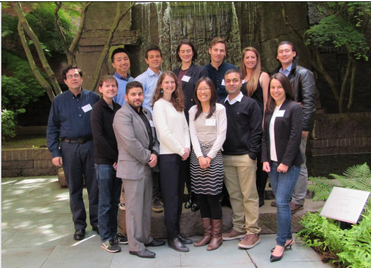
Year 2018 Recipients