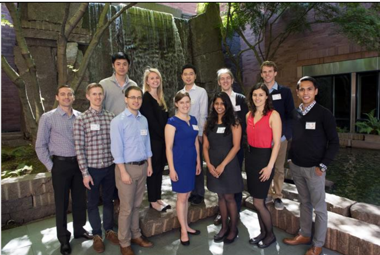
Year 2016 Recipients