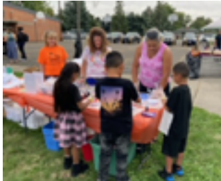
Tough As Nails

Broadened impact by engaging new volunteer groups and initiating new partnerships with recipient organizations.