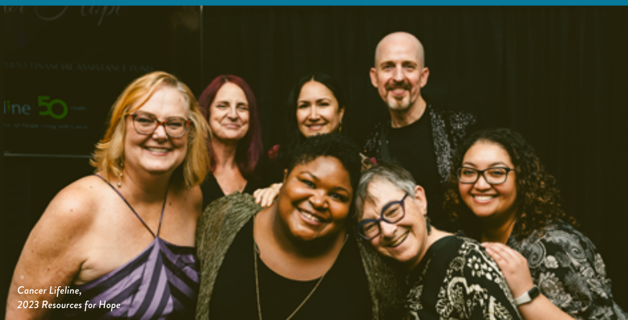
Cancer Lifeline, 2023 Resources for Hope