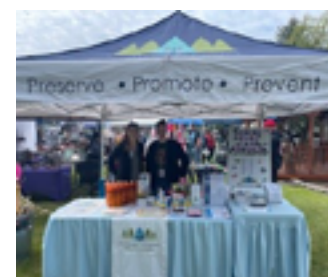
Tri Counties Booth

Streamlined and simplified the application and distribution of fuel vouchers, making it easier for cancer patients to receive travel aid.